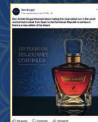
Social media activations