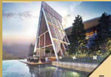
Song Yan Water Pavilion