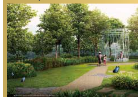
Song Yan Secret Garden