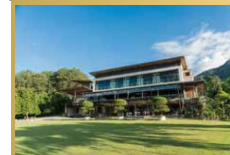
Song Yan Resort