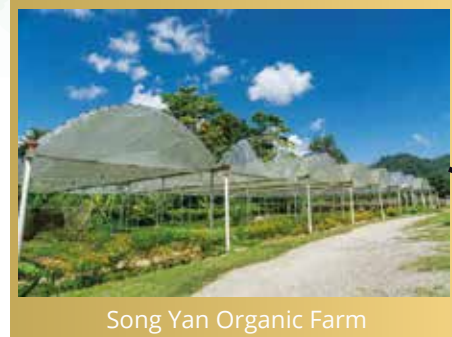
Song Yan Organic Farm