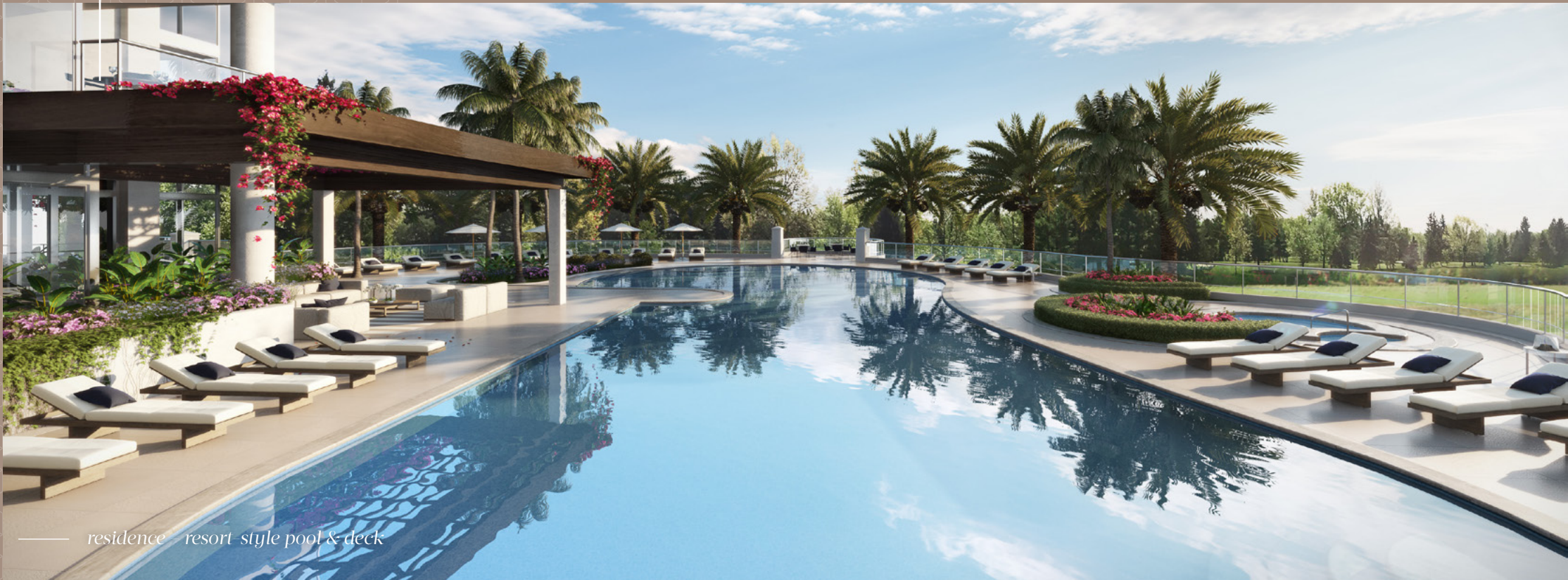
residence resort style pool & deck