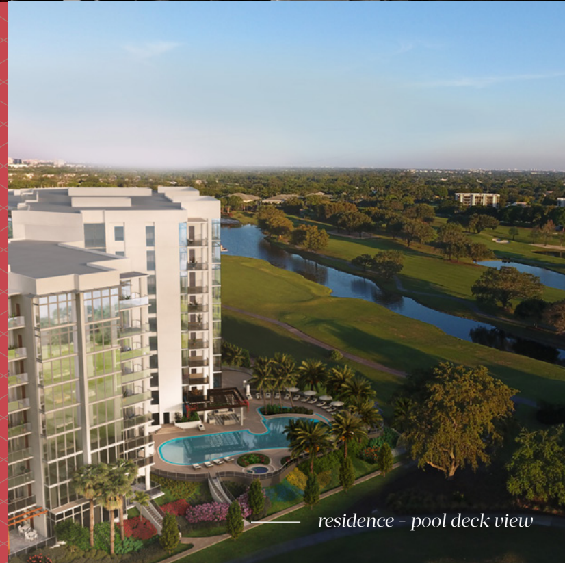
residence – pool deck view